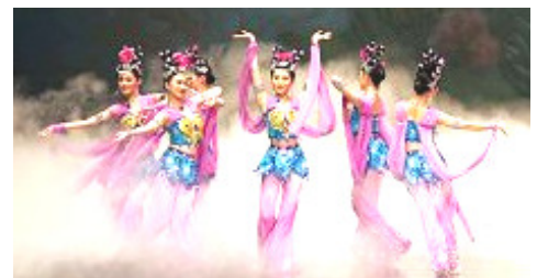
The exquisite performances and profound inner meaning of the Spectacular moved the audience.