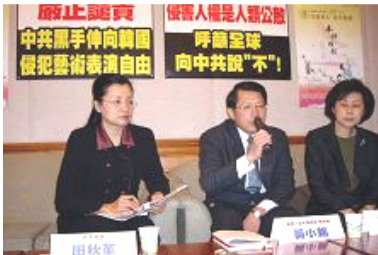
NTDTV holds a press conference in Taiwan's Legislative Council to condemn CCP interference in the New Year Spectacular shows.

(Clearwisdom.net) The Chinese Communist Party (CCP) extended its negative influence into the international community, suppressing New Tang Dynasty TV's (NTDTV) Chinese New Year Spectacular shows. The South Korean Government bowed to pressure from the CCP and cancelled the performance that was due to open on January 6th, 2007 at the National Theatre of Korea in Seoul. NTDTV held a press conference on January 9, 2007 at Taiwan's Legislative Council.